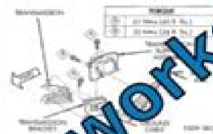
Fig. 21 Engine Mounting—Left