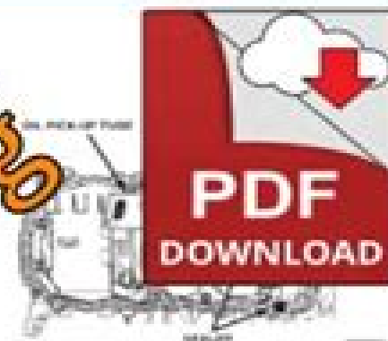
Fig. 25 Oil Pan Gasket Installation