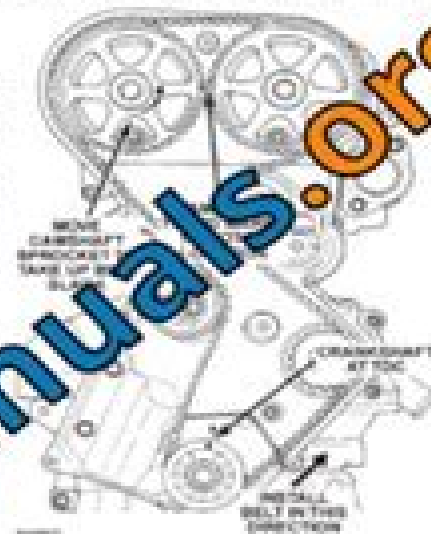
Fig. 23 Timing Belt—Installation