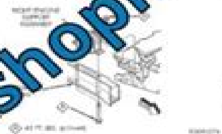
Fig. 22 Engine Mounting—Right Side