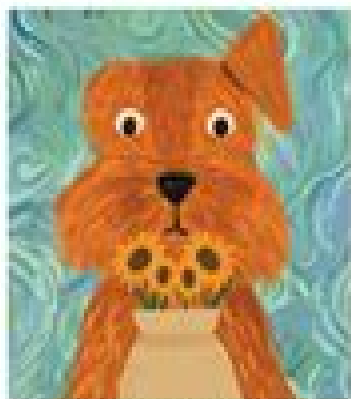
VINDOG VAN GOEN