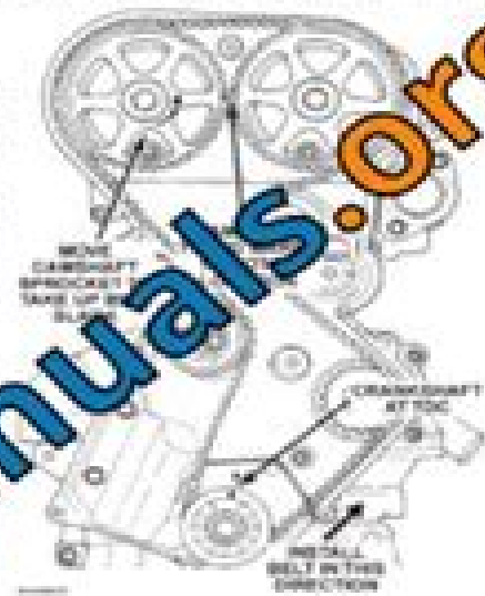
Fig. 23 Timing Belt—Installation