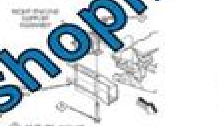
Fig. 22 Engine Mounting—Right Side