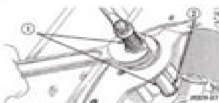
Fig. 45 Removing Distributor Driveshaft Bushing 1 - SPECIAL TOOL C-500 2 - BUSHING