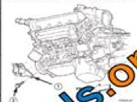
Fig. 34 Engine Insulator Mount Left Vehicle-Left Side 1 - INSULATOR MOUNT 2 - ENGINE 3 - THROUGH-BOLT 4 - NUT