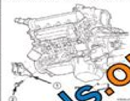
Fig. 34 Engine Mount—Left Vehicle—Left Side 1 - ENGINE MOUNT 2 - MOUNTING BOLT