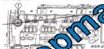
Fig. 46 Distributor Drive Shaft Rot

(3) Insert the shaft so that after the gear spiral into place, it will mesh with the oil pump shaft. The oil pump shaft should be aligned towards the left front intake manifold attaching bolt hole (Fig. 46).