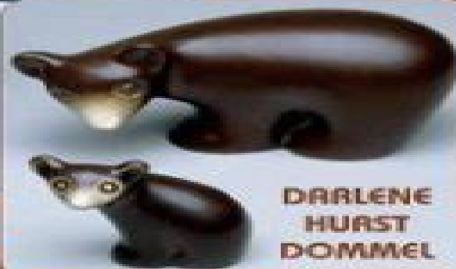
DARLENE HURST DOMMEL