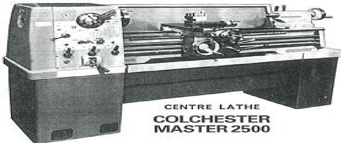
CENTRE LATHE COLCHESTER MASTER 2500

THE COLCHESTER LATHE COMPANY LTD., COLCHESTER ESSEX ENGLAND