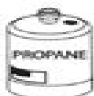
16.4 oz. (465 g) propane bottle not included