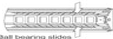
Ball bearing slides