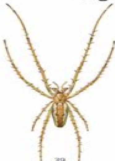
39. Long-jawed Orbweb Spider Tetragnatha montana ♀ 10 mm