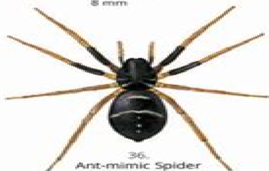
36. Ant-mimic Spider Micaria pulicaria ♀ 4 mm