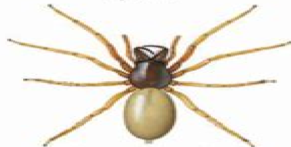
38. Woodlouse Spider Dysdera crocata ♀ 12 mm