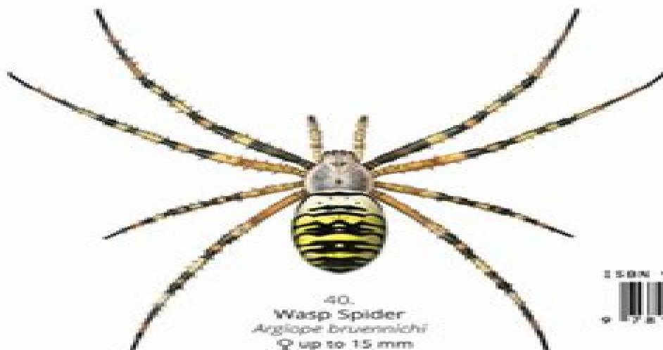
40. Wasp Spider Argiope bruennichi ♀ up to 15 mm