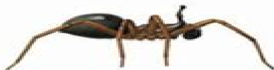
34. Money Spider Walckenaeria acuminata ♂ 3 mm