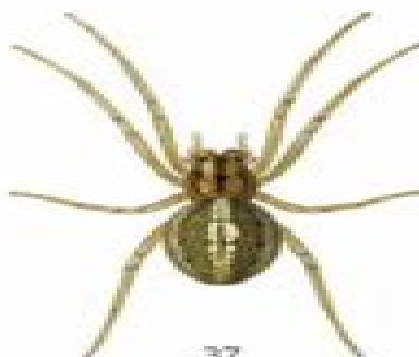
37. Long-jawed Orbweb Spider Pachygnatha clercki 6 mm