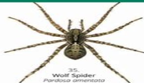
35. Wolf Spider Pardosa amentata ♀ 7 mm