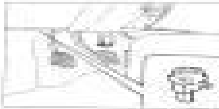
Diagram illustrating the greenhouse effect. Light rays from the sun enter the greenhouse and are reflected back inside, warming the interior.

The greenhouse effect is a natural process that warms the Earth's surface. When the Sun's rays hit the Earth, some of the energy is absorbed by the ground and water. This energy is then transferred to the air in the form of heat. The air molecules vibrate and move faster, which warms the air. Some of the heat is lost to space, but some is reflected back to the Earth by greenhouse gases like carbon dioxide and water vapor. This process keeps the Earth warm enough for life to exist. The greenhouse effect is a natural process that warms the Earth's surface. When the Sun's rays hit the Earth, some of the energy is absorbed by the ground and water. This energy is then transferred to the air in the form of heat. The air molecules vibrate and move faster, which warms the air. Some of the heat is lost to space, but some is reflected back to the Earth by greenhouse gases like carbon dioxide and water vapor. This process keeps the Earth warm enough for life to exist.