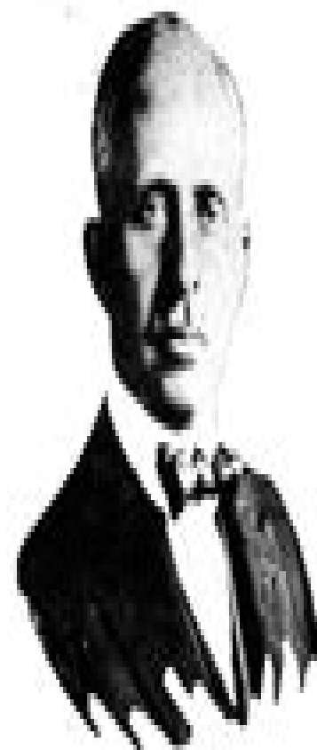
James C. Penney

571 Stores Now Controlled by Man Who Started 23 Years Ago in Kemmerer, Wyoming, With One Unimposing Little Shop